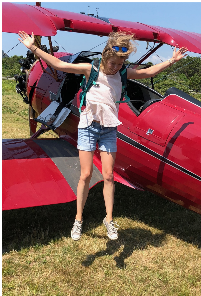
Fig 2 | Representative study participant jumping from aircraft with an empty backpack. This individual did not incur death or major injury upon impact with the ground

The PARACHUTE trial satirically highlights some of the limitations of randomized controlled trials. Nevertheless, we believe that such trials remain the gold standard for the evaluation of most new treatments. The PARACHUTE trial does suggest, however, that their accurate interpretation requires more than a cursory reading of the abstract. Rather, interpretation requires a complete and critical appraisal of the study. In addition, our study highlights that studies evaluating devices that are already entrenched in clinical practice face the particularly difficult task of ensuring that